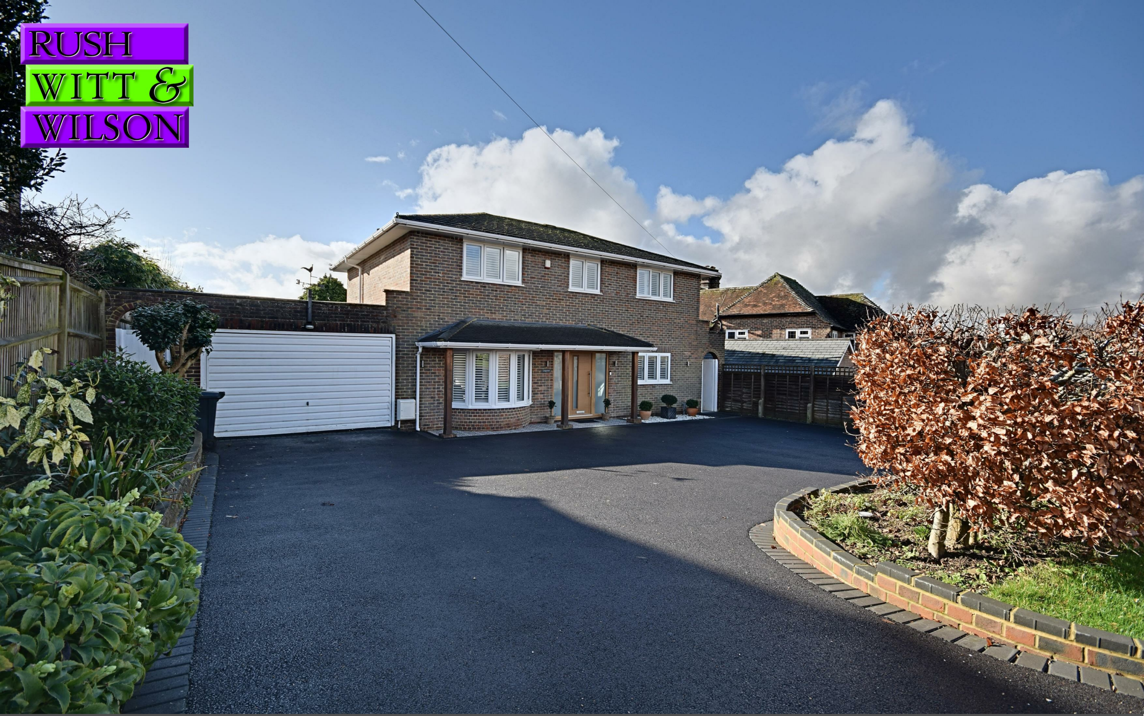
Longview Maple Avenue, Bexhill-On-Sea, East Sussex TN39 4ST £895,000